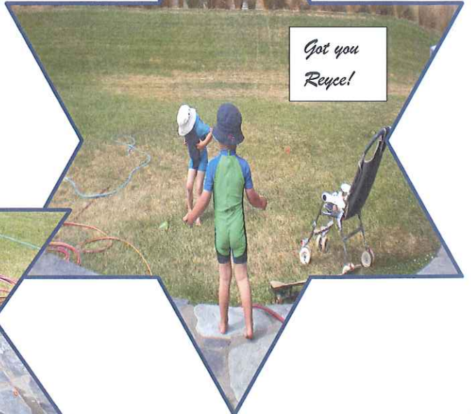
Got you Reyce!