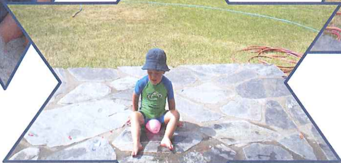
It will not burst